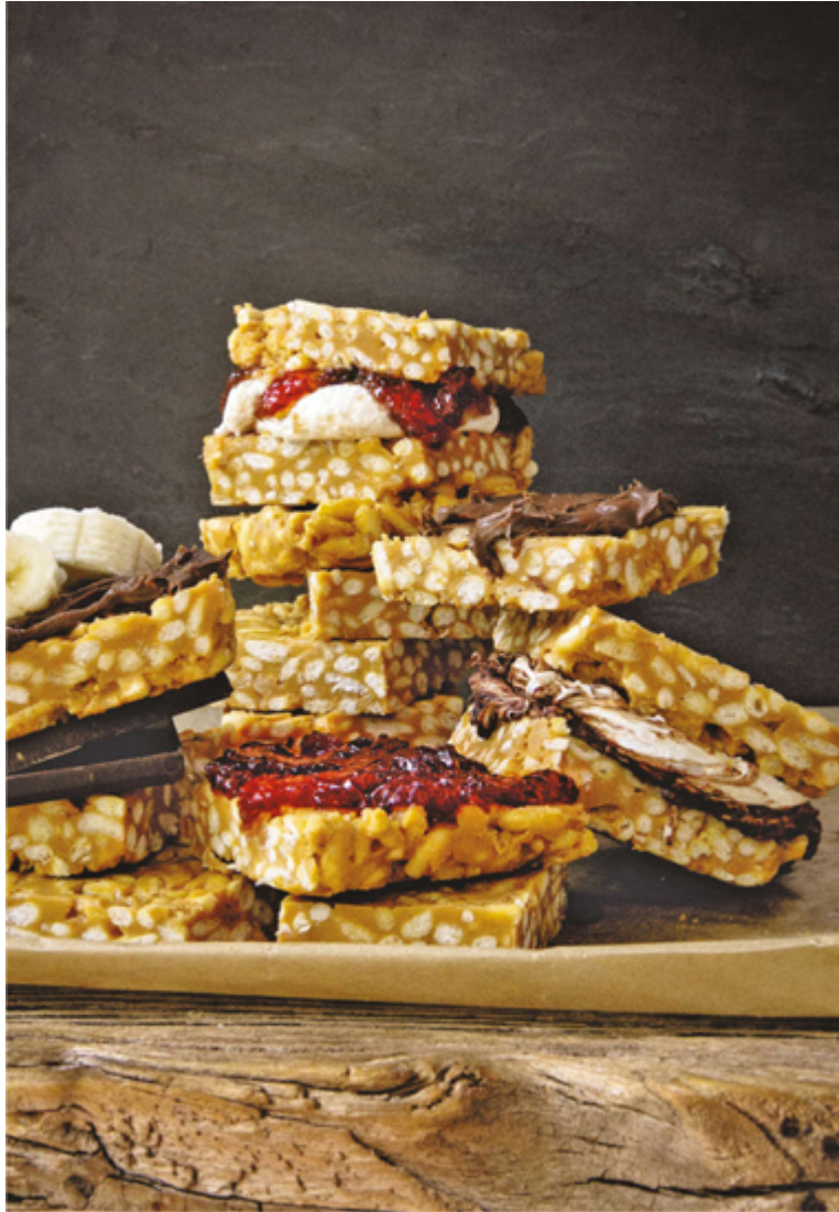
Peanut Butter & Honey Rice Crispy Treats