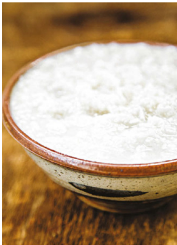
White Rice Congee