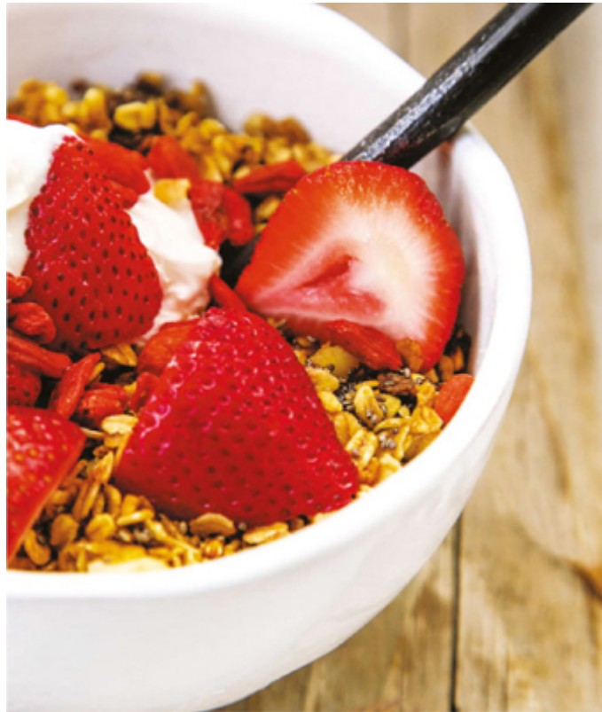
Coconut & Fig Granola