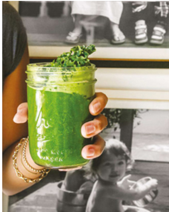
Joyful Green Smoothie