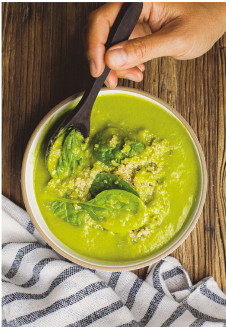
Seasonal Greens Soup