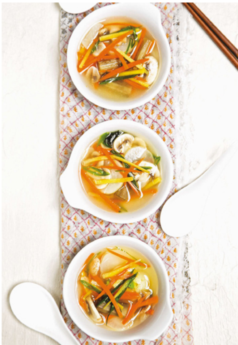
Miso & Burdock Soup