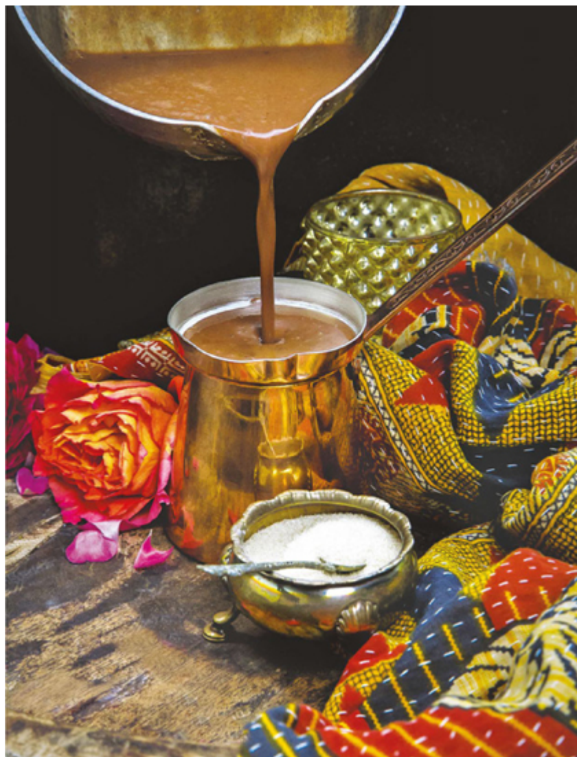
Ceremonial Hot Chocolate