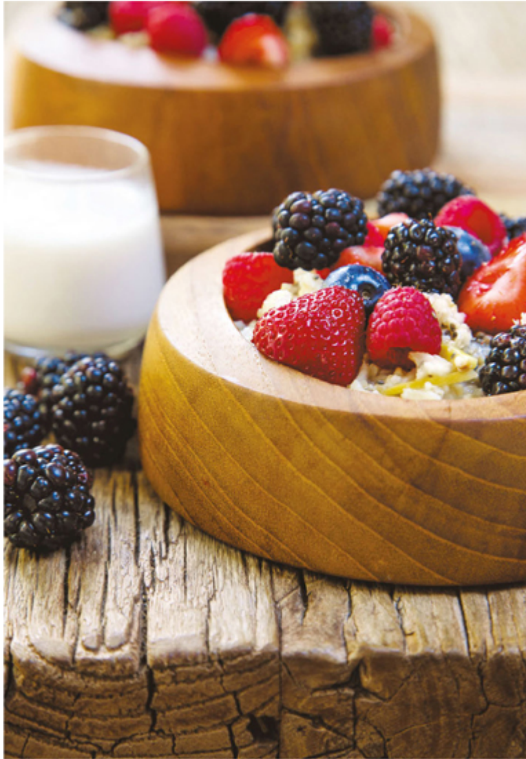
Oats & Chia Congee