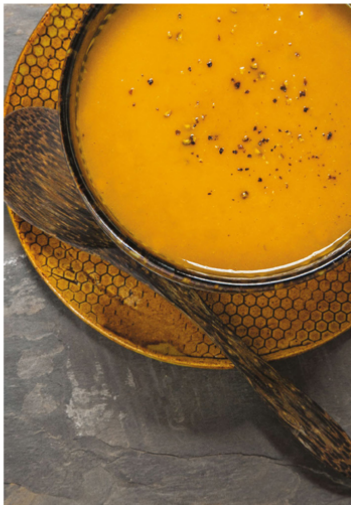
Creamy Kabocha & Red Lentil Soup