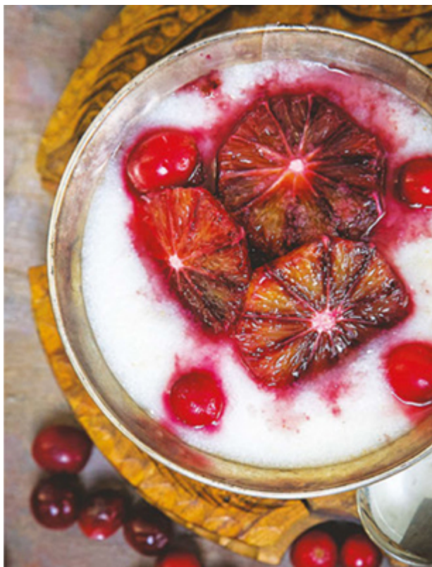
Pink Cranberry Porridge