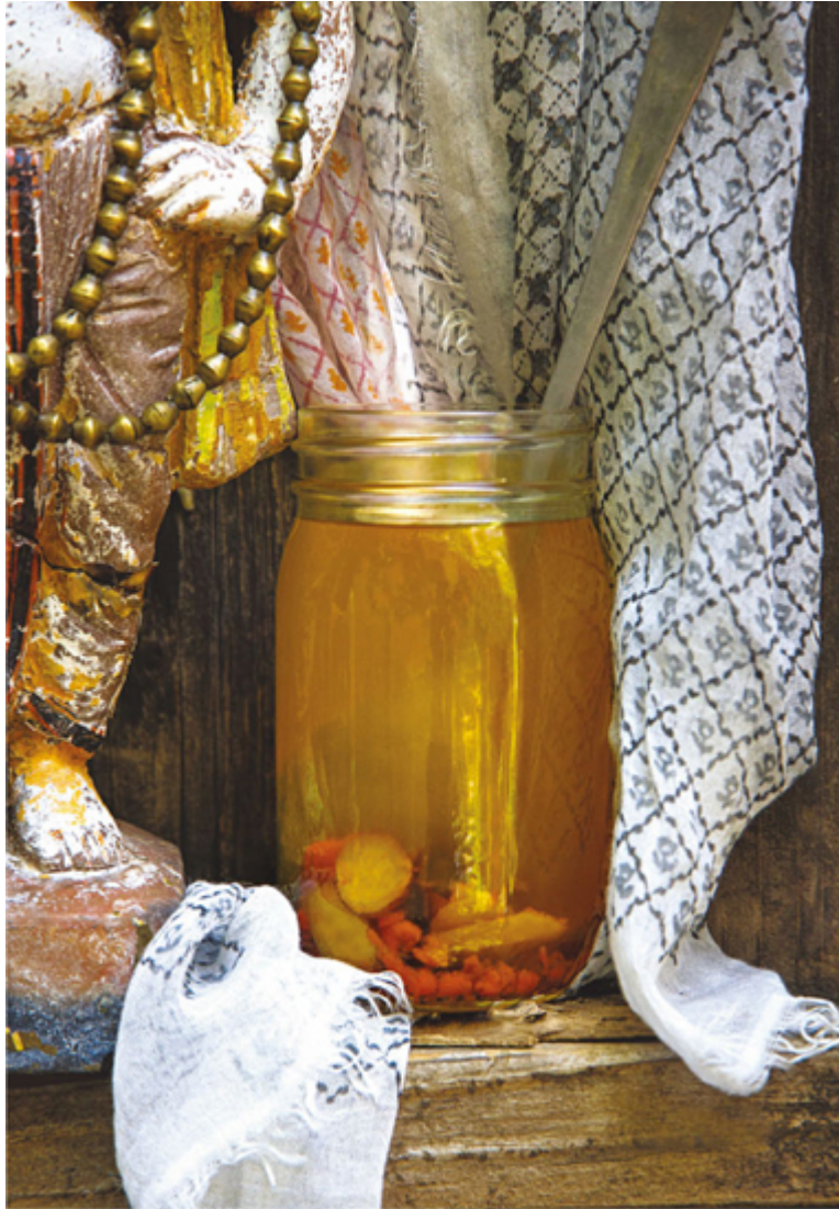
Ginger, Turmeric & Honey Tea