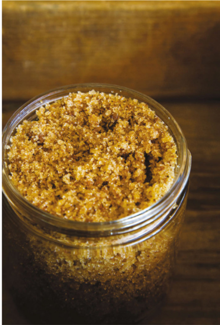
Gingerbread Sugar Scrub