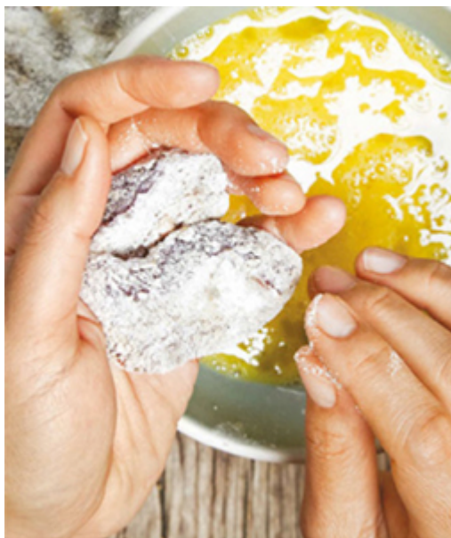
Breaded Gingered Kidneys