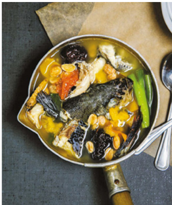
Fish, Papaya & Peanut Soup