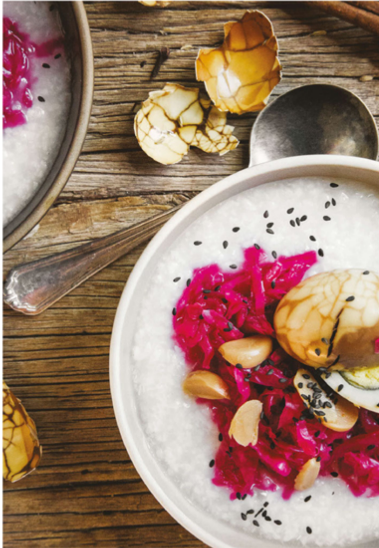
Pickled Congee with Tea Eggs & Pickles