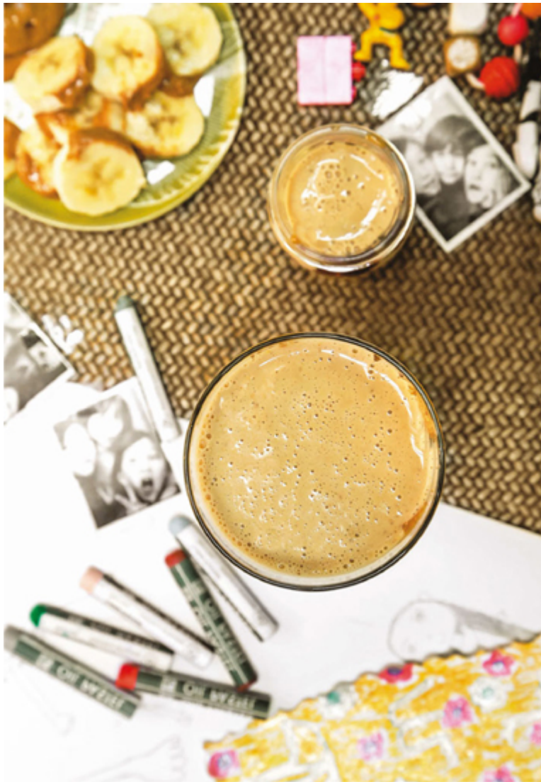
PB & J Smoothie