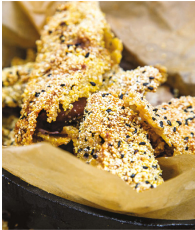
Breaded Gingered Kidneys

Prepare the kidneys by cutting them in half horizontally. Remove the vein and rinse them under running water. Dry with a paper towel. Chop into bite-size pieces, then add them to the marinade. Let sit at room temperature for 15 to 30 minutes, then cover with plastic wrap and refrigerate.