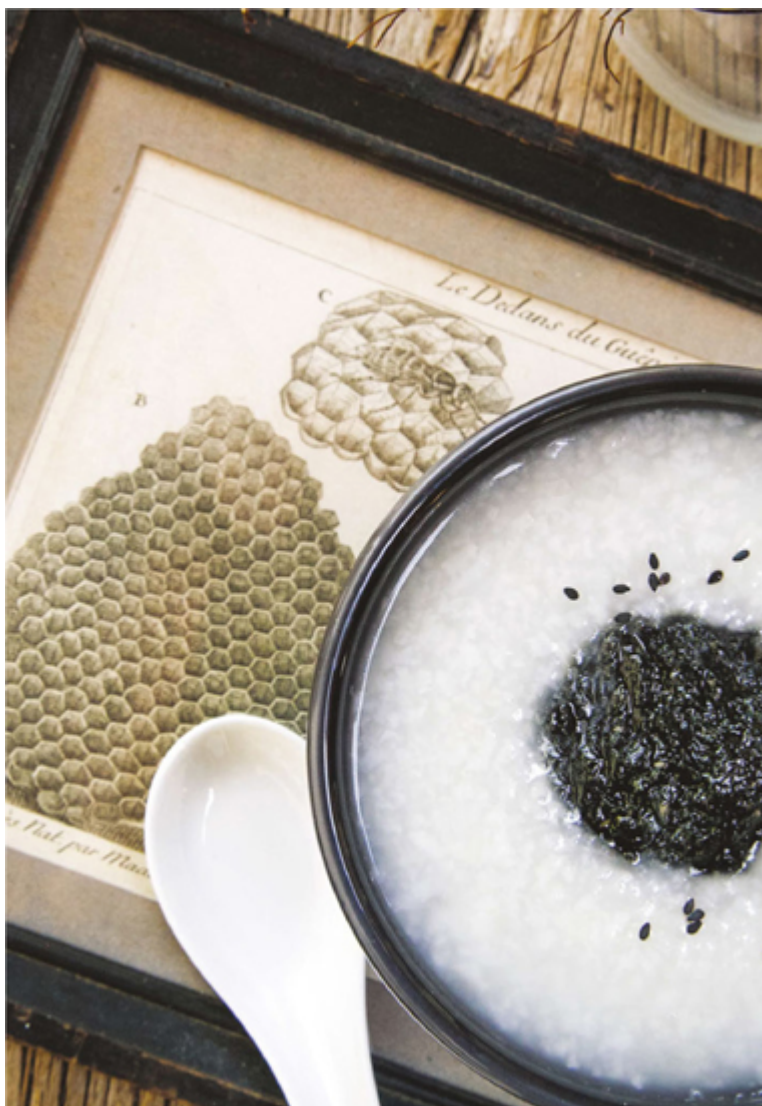
Sweet Rice Congee with Black Sesame Seed Paste