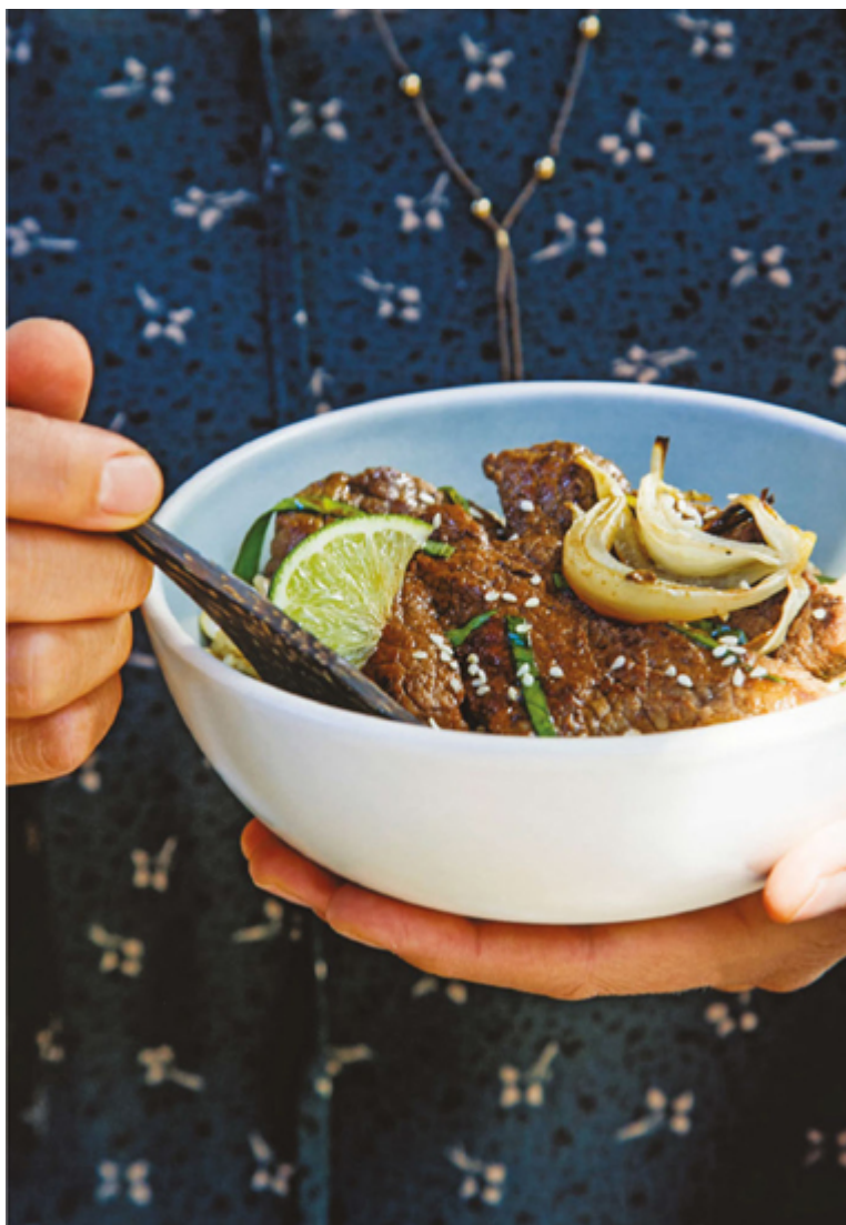
Basil & Beef Strips Congee