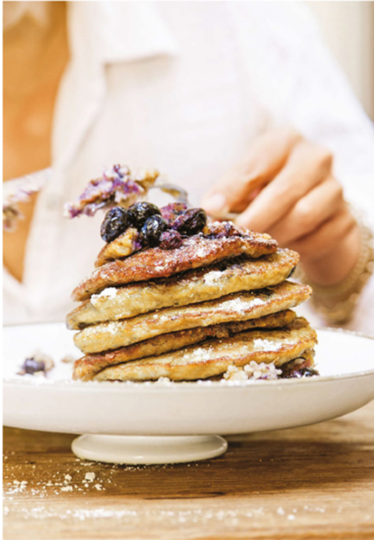
Blueberry & Oat Pancakes