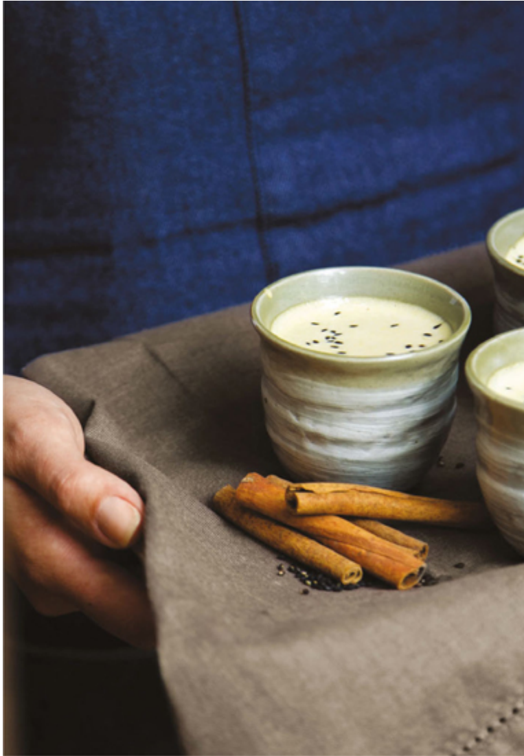
Spiced Vanilla Egg Custard