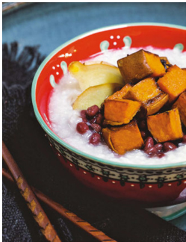
Adzuki & Sweet Potato Congee