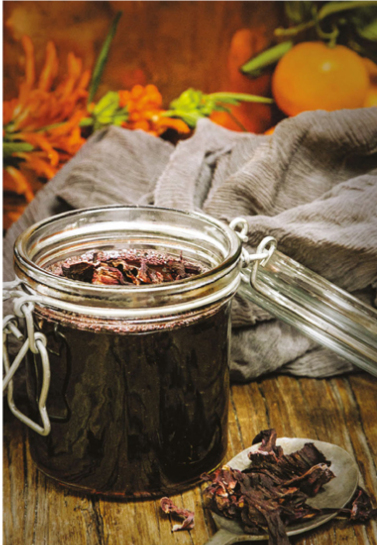
Hibiscus Flower, Ginger & Cinnamon Tea