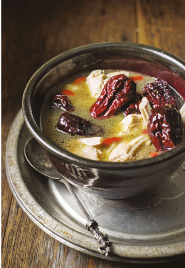
Chicken, Red Dates & Ginger Soup