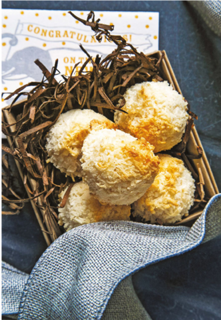
Vanilla Coconut Haystacks