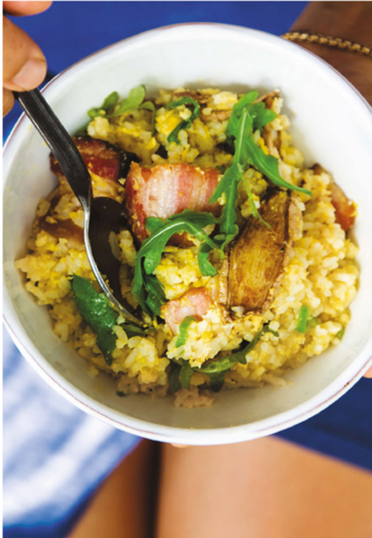
Ginger Fried Rice