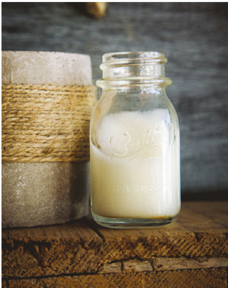
Rose & Coconut Body Oil